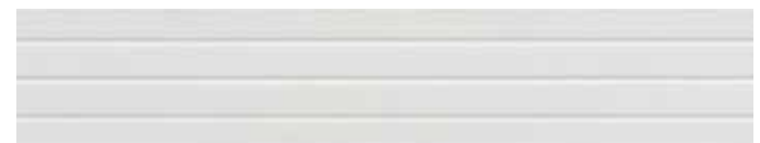
RIBLINE – Woodgrain texture