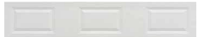
STANFORD – Woodgrain texture