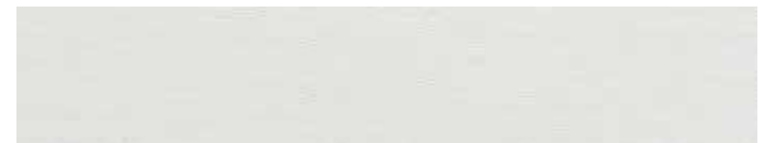
FLATLINE – Woodgrain texture